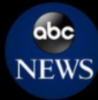
ABC News ✓ @ABC

With widespread reports - including Arkansas - of ballot fraud and/or irregularities, it would seem the MSM is still trying to whitewash the voices of 70 million Americans from this election